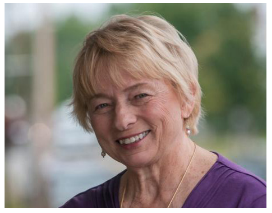
GOVERNOR-ELECT JANET MILLS