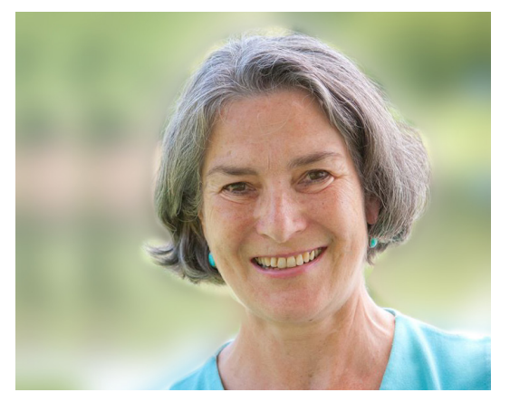
SENATOR ELOISE VITELLI