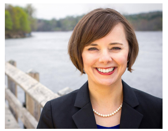
SENATOR SHENNA BELLOWS